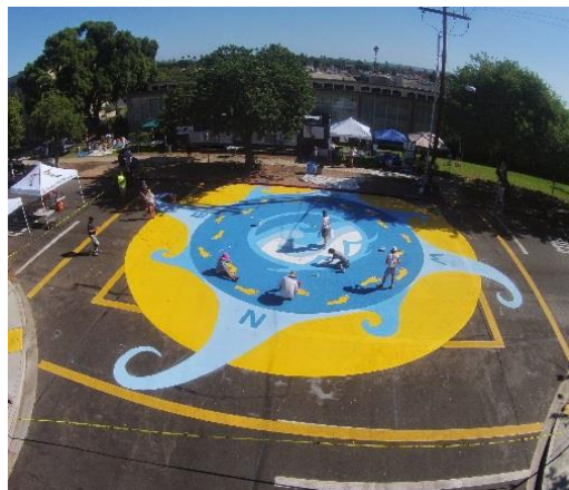
Photos of a completed pedestrian crossing mural at the intersection of Diamond & Haines Street, 9/20/14, coordinated and sponsored by beautifulPB.