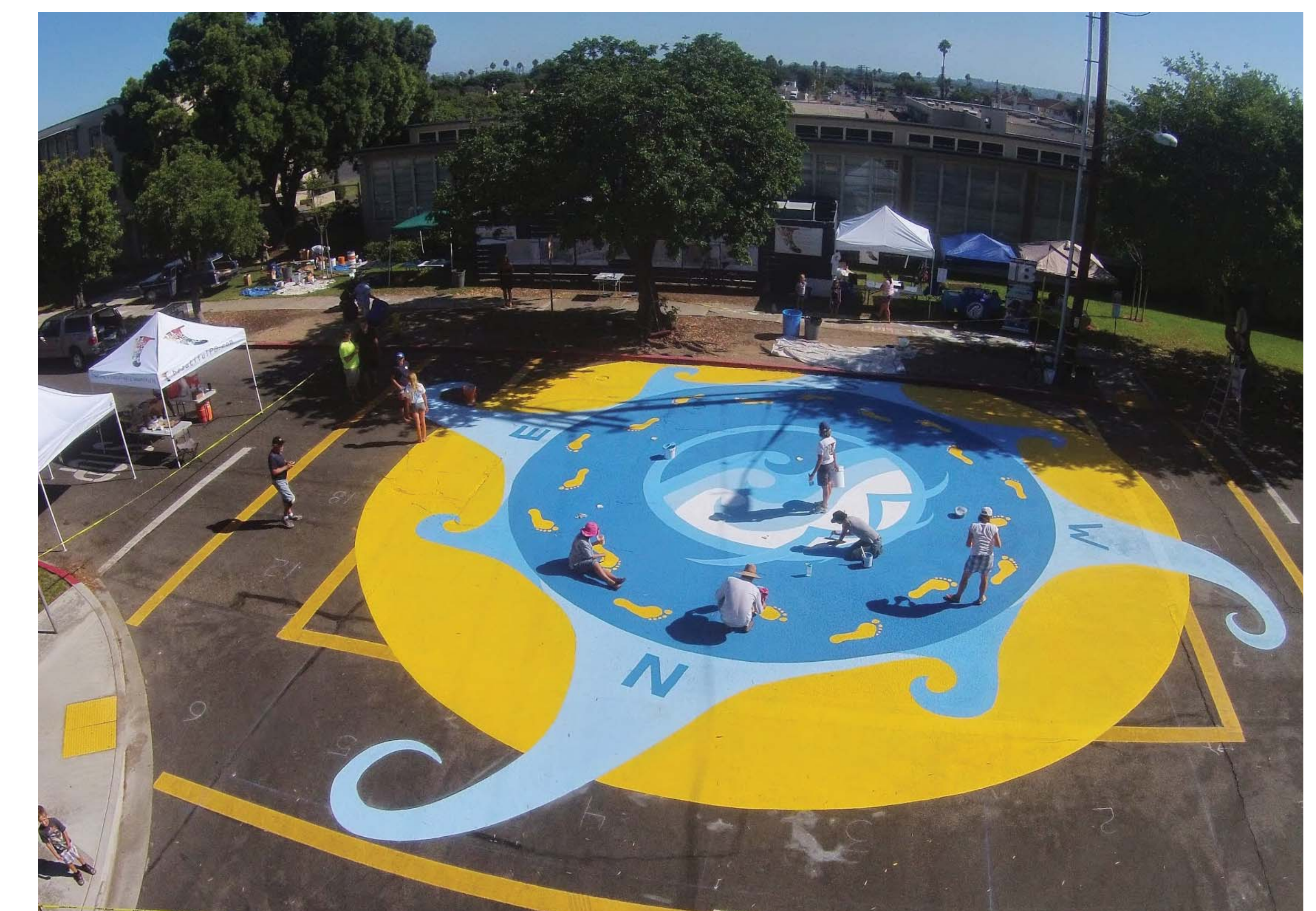
Photos above of a completed pedestrian crossing mural at the intersection of Diamond & Haines Street, 9/20/14, coordinated and sponsored by beautifulPB.